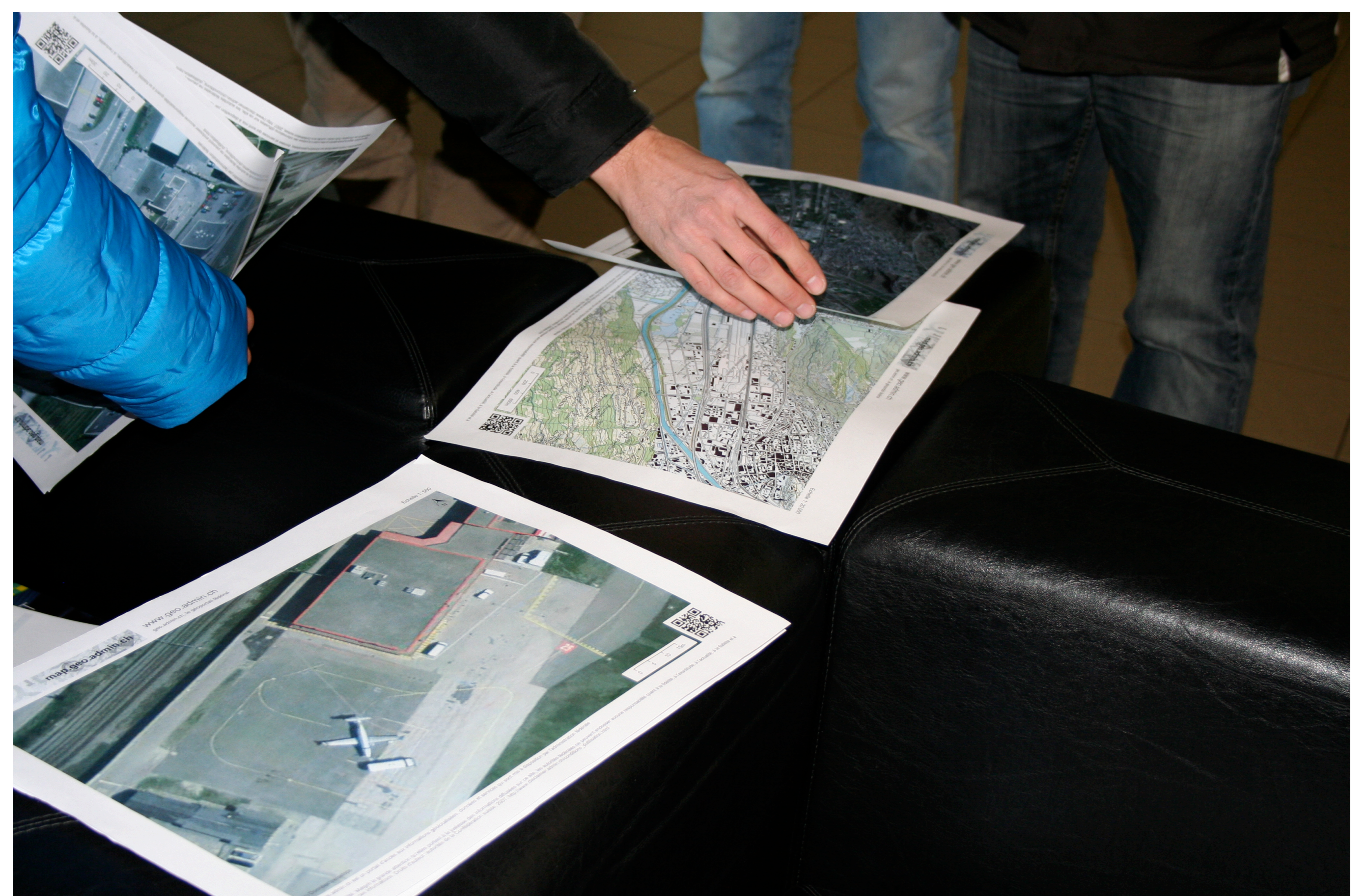
Fig. 2. Cours MIMMS 2013

<< . . . and it is often an excuse to ourselves that we imagine that things are impossible >> (François de la Rochefoucauld)