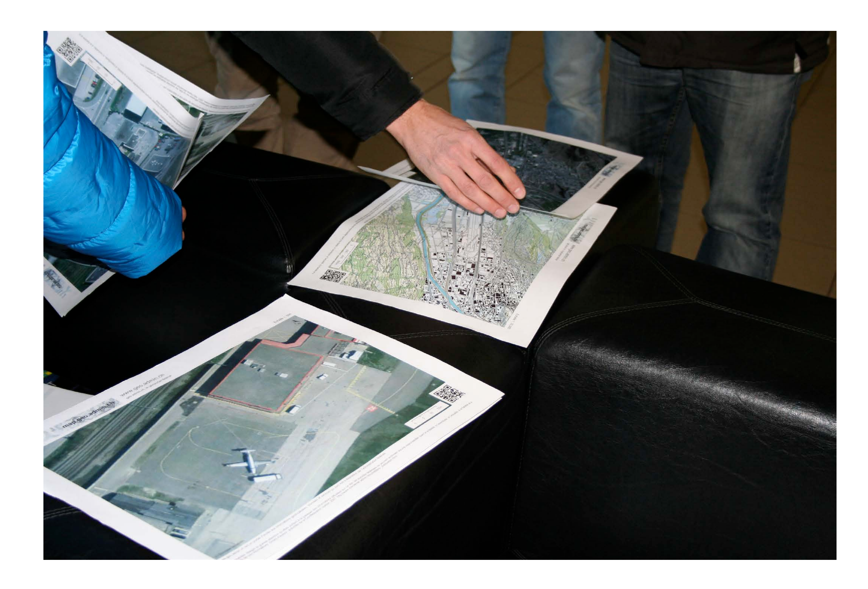
Fig. 2. Cours MIMMS 2013

The introduction of obstetric courses has been welcomed by all pre-hospital practitioners.