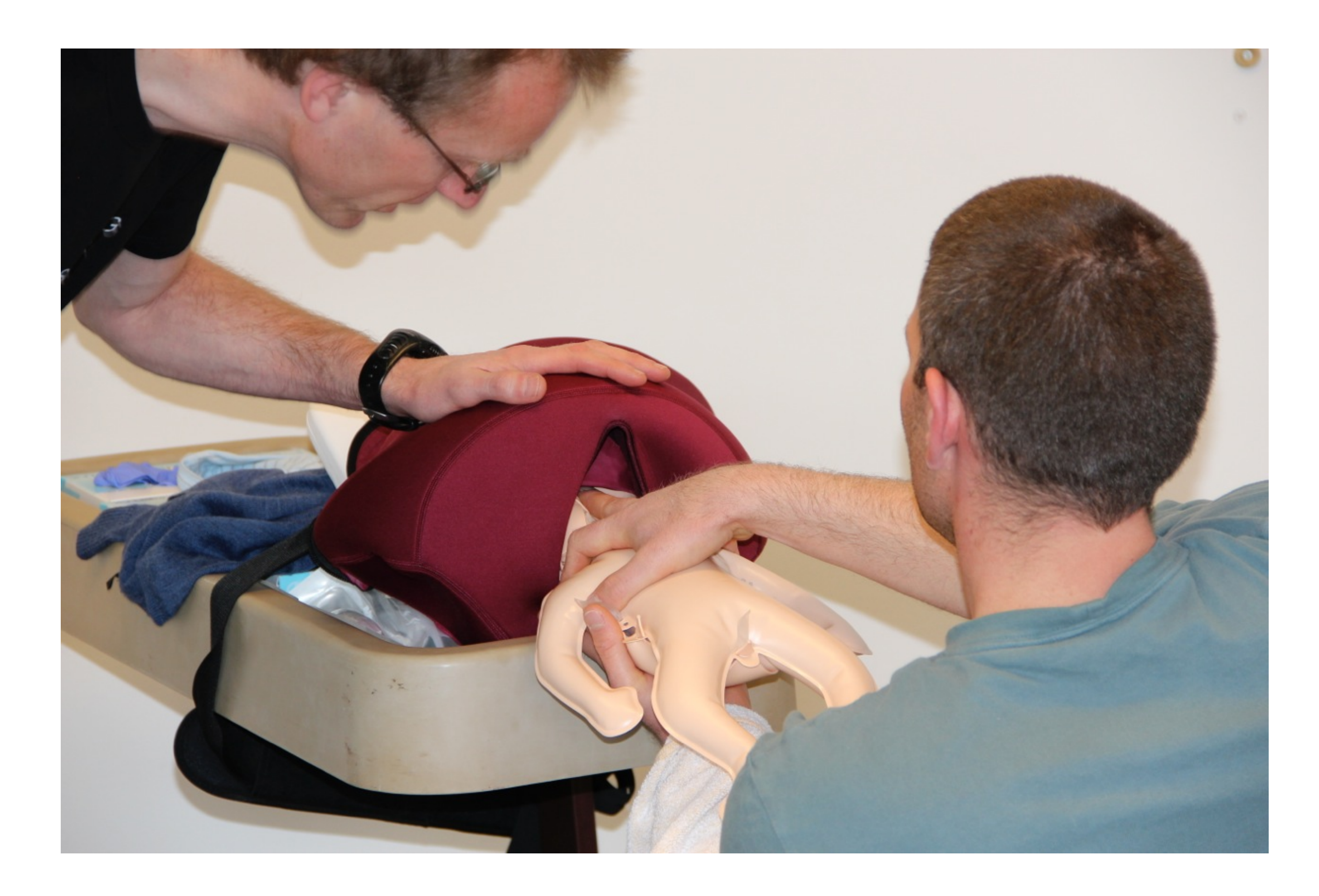
Fig. 1. ES ASUR, en Budron C8, 1052 Le Mont-sur-Lausanne